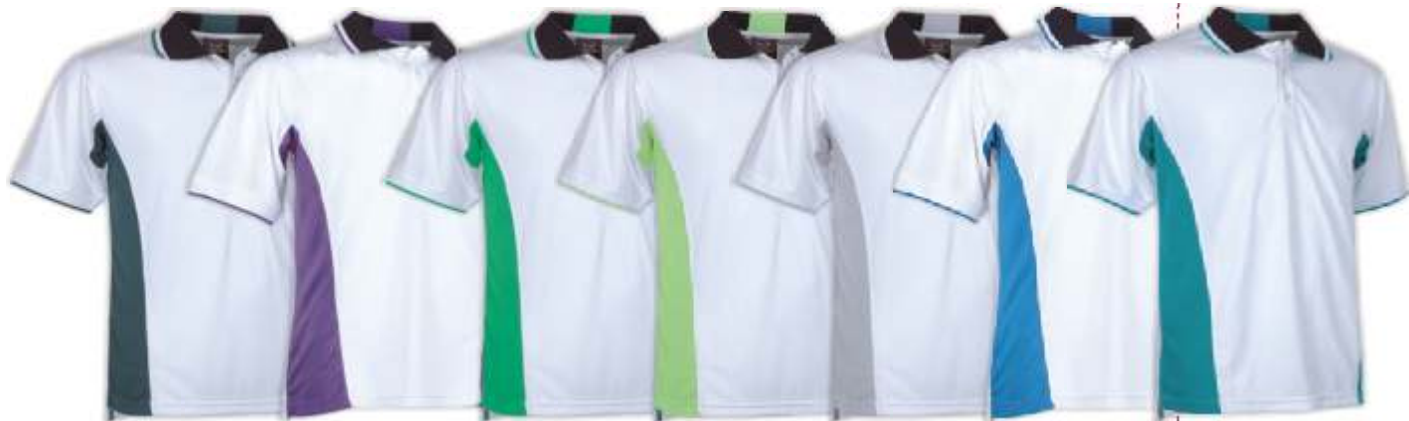
WHITE / DARK BOTTLE / BLACK